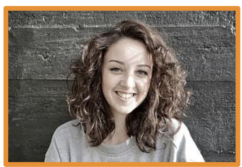
English Learner ( EL )